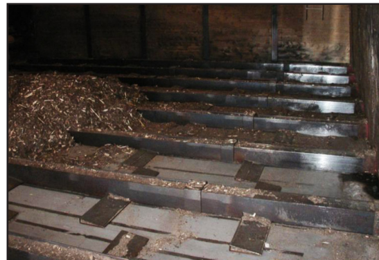
After 3 year inspection, the application is in perfect condition