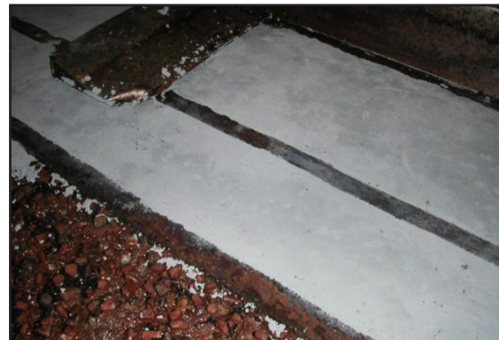
Rebuilding with ARC 791