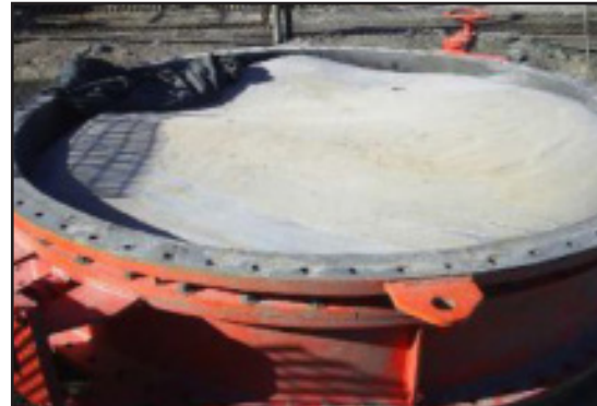
Disc before rubber removal

*ARC BX2 is the "Bulk" package size of ARC 897